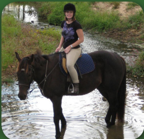
Small Cap Value