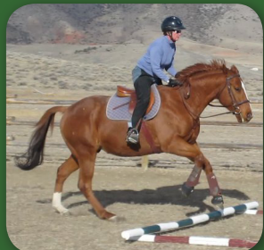
Laugh A Day