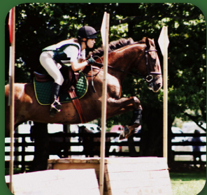
To The Woodshed